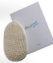
• BATHROOM FIBER