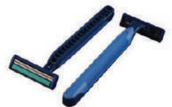
• SHAVING BLADE