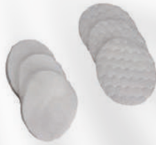
• MAKE-UP COTTON