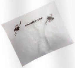
• SHOWER CAP