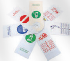
• DND CARDS