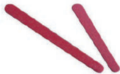
• NAIL FILE