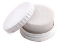
• SHOE WIPER