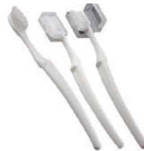
• TOOTH BRUSH