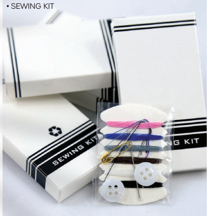
• SEWING KIT