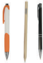
• PEN & PENCIL