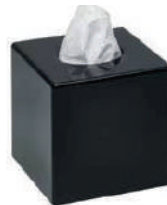
• PULL BOX TISSUE