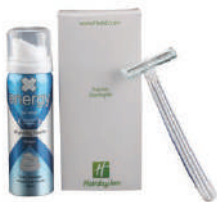
• SHAVING SET