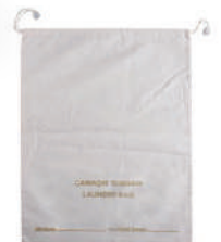
• LAUNDRY BAG