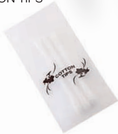
• COTTON TIPS