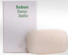
• BOXED SOAP